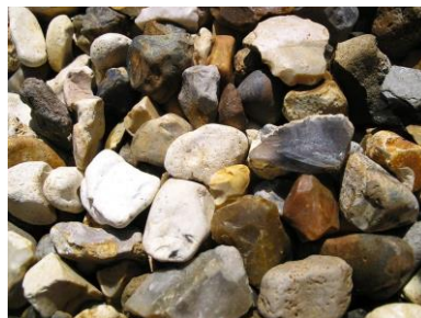
Pickle, IMG6282 http://mrq.bz/BDvXAU