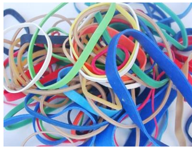
DuBoix, m4h9a2 025 http://mrq.bz/Wx1pcU