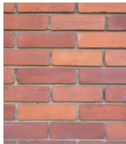
Alvimann, Texture_-_bricks_1 http://mrq.bz/lequ2V