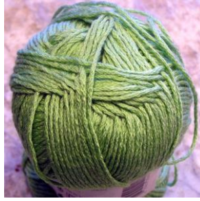
Beglib, Needle ready http://mrq.bz/M5ZmNH