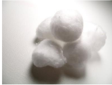
Jeltovski, mf88 http://mrq.bz/2EFntU