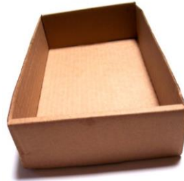
Cohdra, 100_3540 http://mrq.bz/7QWDoD