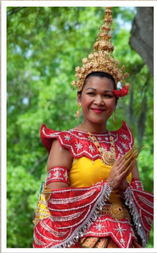
Keyseeker, SongKran_2011_692.jpg http://mrg.bz/1XX1xp

This hat and costume are worn in Thailand during special dances and ceremonies.