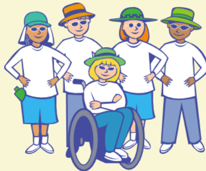
Ocal, Sunsquad group clip art , http://www.clker.com/clipart-sunsquad-group.html