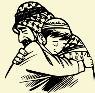
Ocal, Father hug son clip art , http://www.clker.com/clipart-10455.html