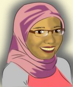
Ocal, Hijab clip art , http://www.clker.com/clipart-hijab.html

In Australia, we have many different cultures living together. It is important that we learn about each other, so that we understand and live together respectfully. Just because someone wears a different hat or head covering doesn't mean they don't belong.