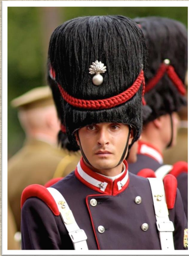
1st Sardinia Grenadiers Bastille Day 2007, http://en.wikipedia.org/wiki/File:1st_Sardinia_Grenadiers_Bastille_Day_2007_n1.jpg CC-BY 2.5 https://creativecommons.org/licenses/by/2.5/deed.en